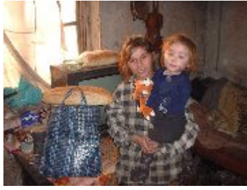
CSP family in Ukraine with food parcel