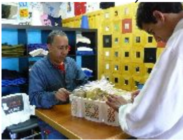
Preparing food parcels in Israel