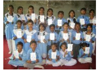
graduation at mission school Pakistan