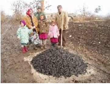
Winter fuel for Moldovan family